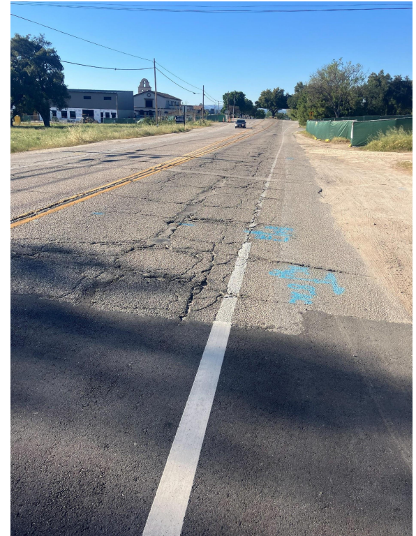
Atascadero, El Camino Real