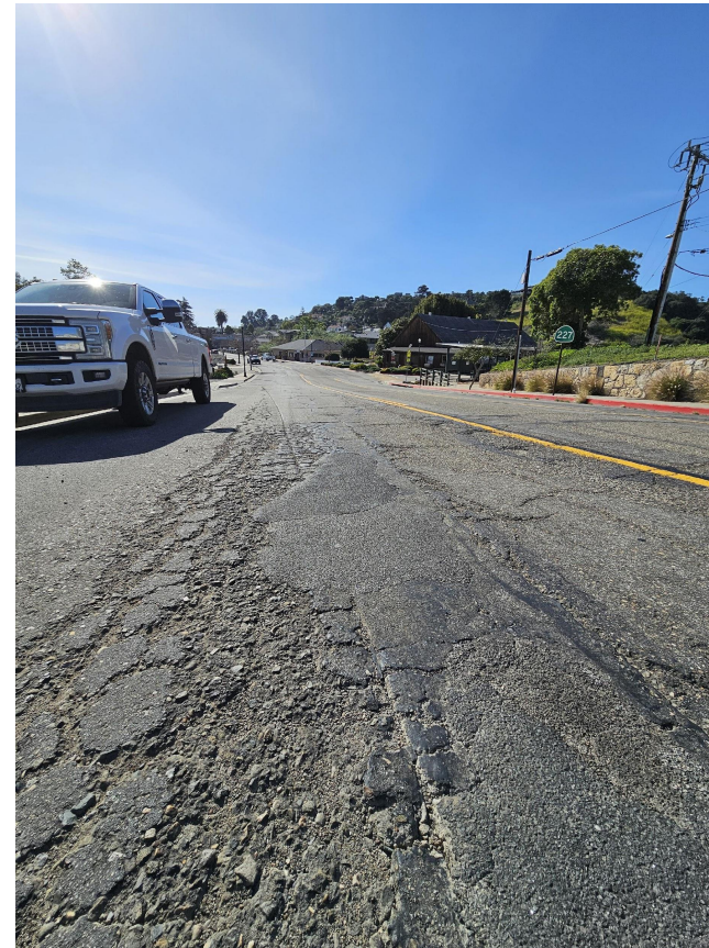
Arroyo Grande, Grand Ave